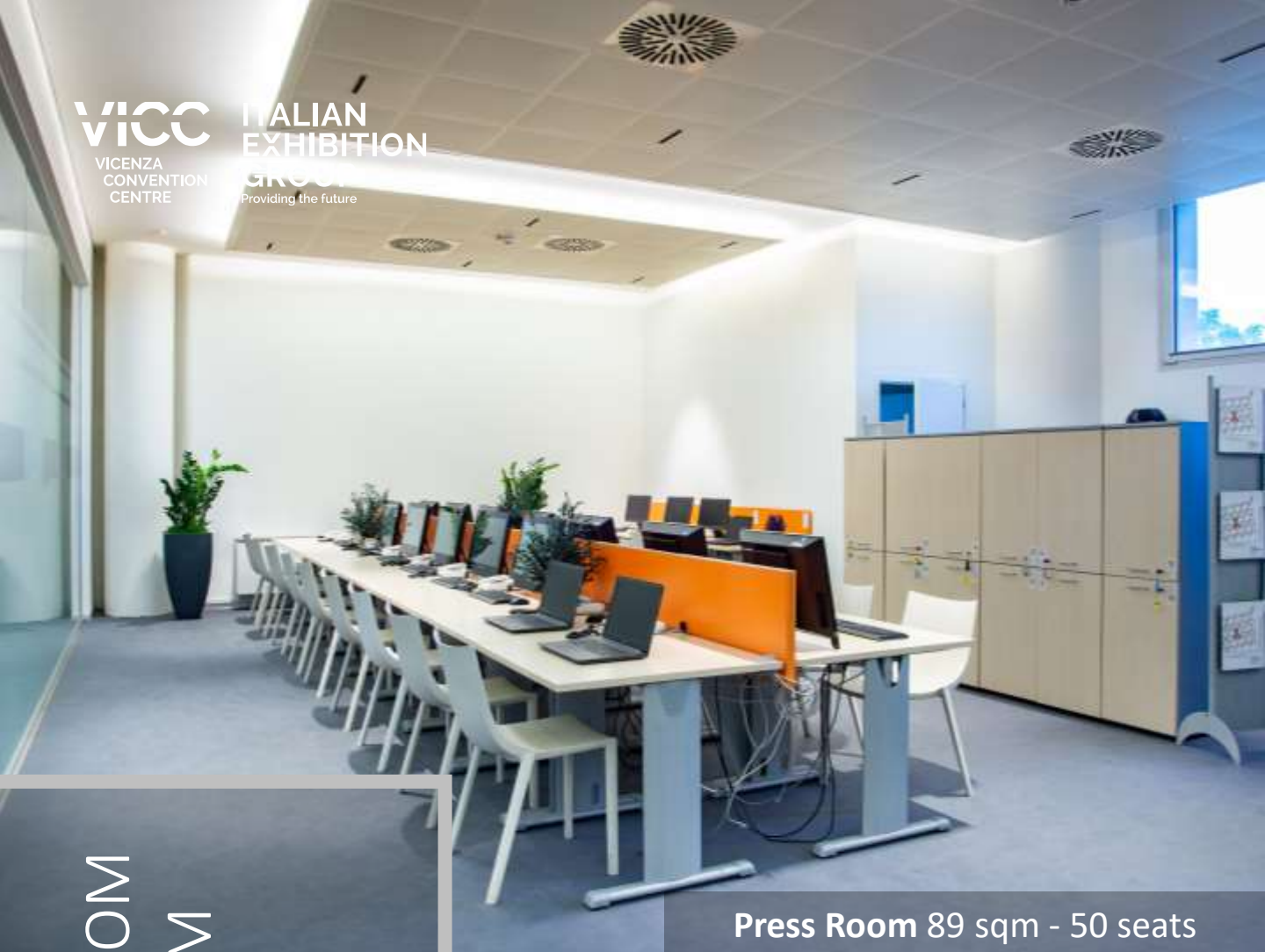
Press Room 89 sqm - 50 seats