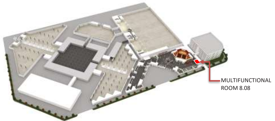
INFORMATION - MULTIFUNCTIONAL ROOM 8.08