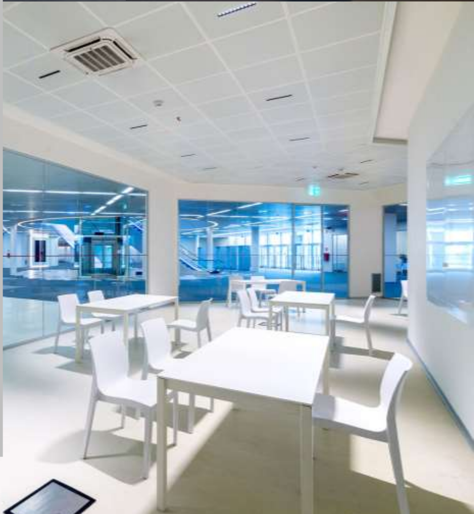
8.04 64 sqm - 51 seats