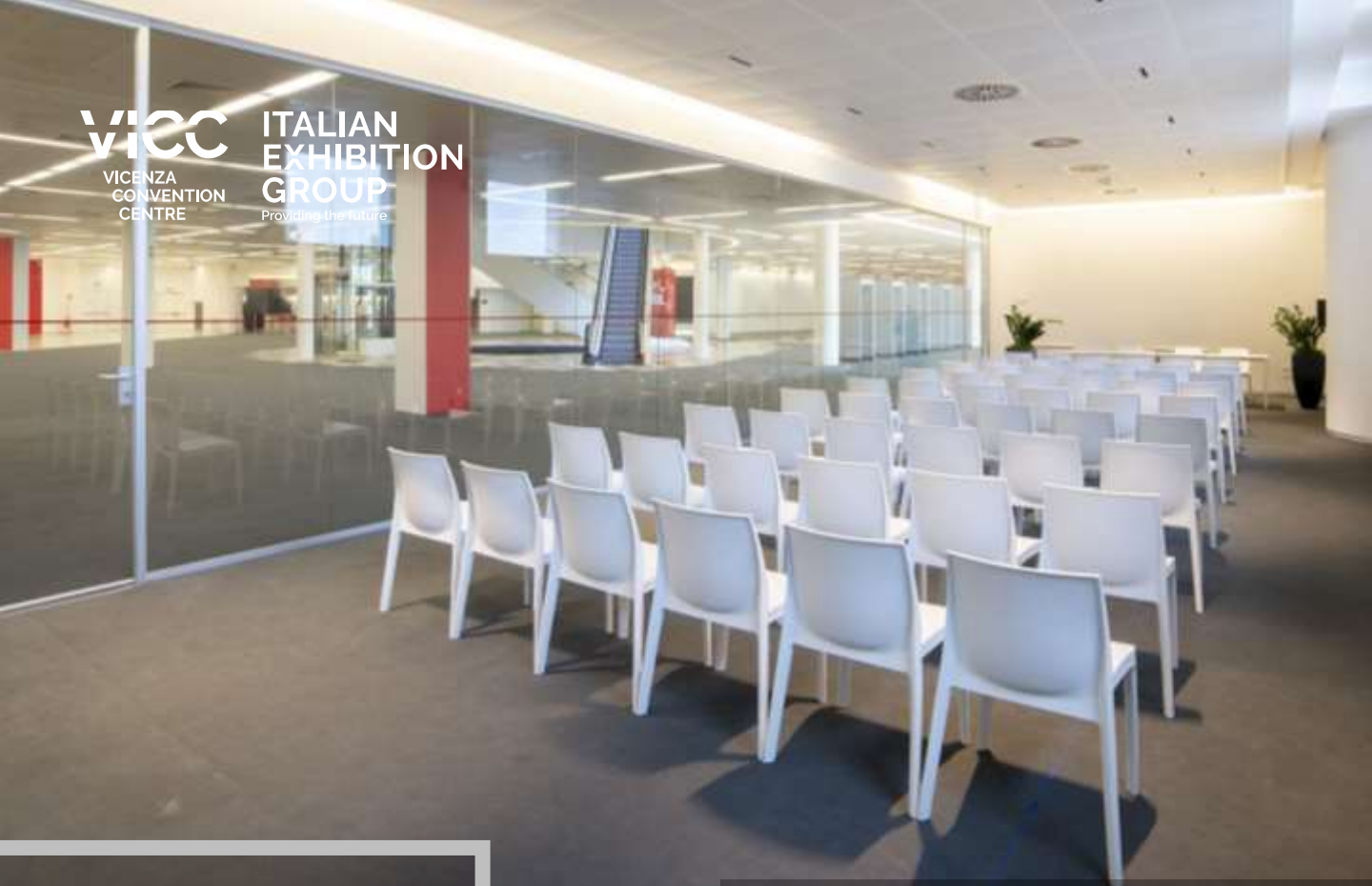
8.03 85 sqm - 64 seats