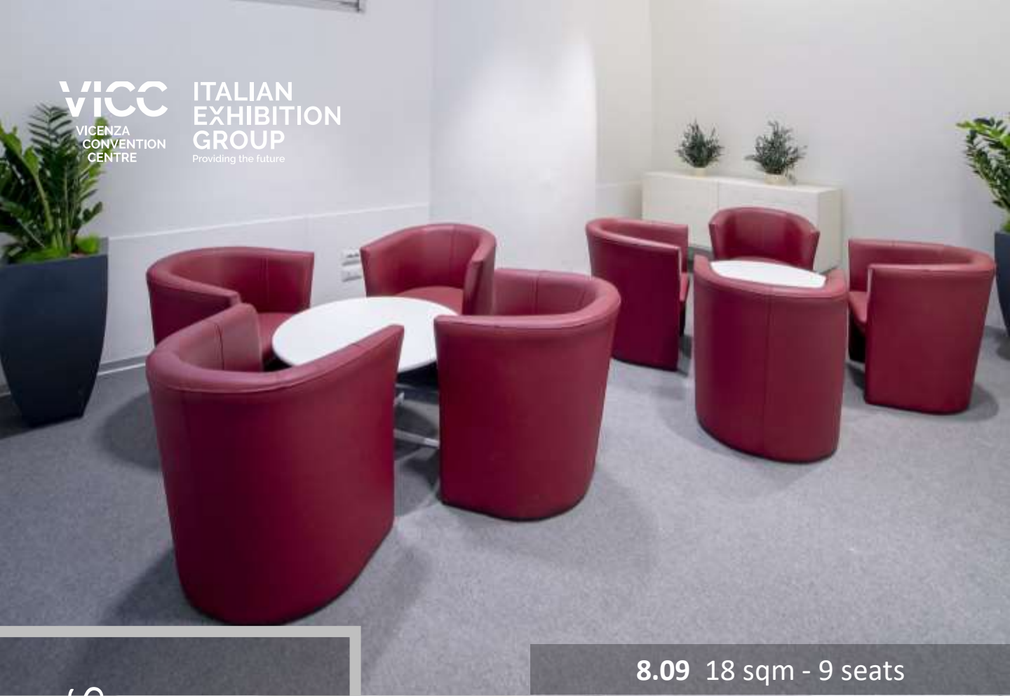
8.09 18 sqm - 9 seats