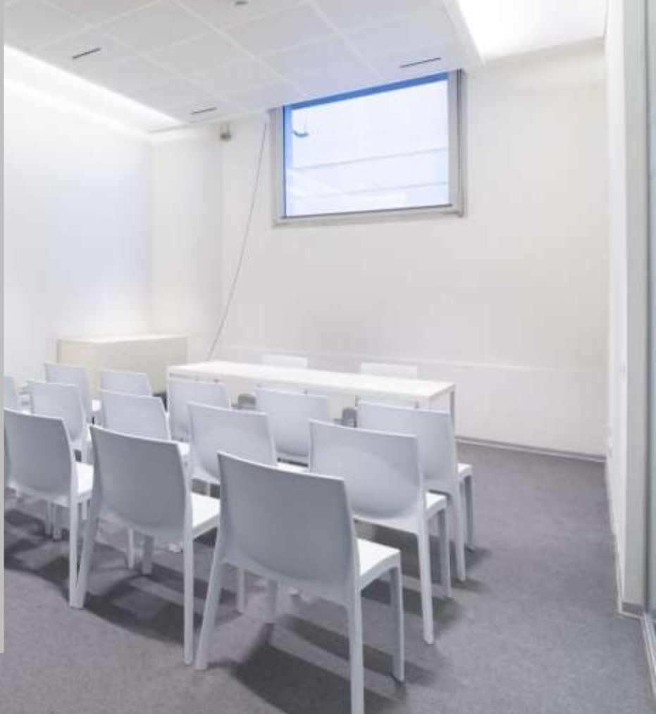
8.10 26 sqm - 12 seats